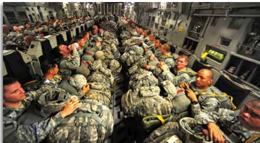
82ND AIRBORNE DIVISION DURING JOINT OPERATIONS ACCESS EXERCISE AT FORT BRAGG