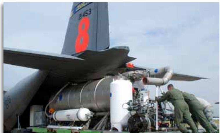
CREW MEMBERS FROM NC AIR NATIONAL GUARD LOAD MODULAR AIRBORNE FIRE FIGHTING SYSTEMS INTO A C-130 TO HELP FIGHT WILDFIRES IN ARIZONA AND NEW MEXICO