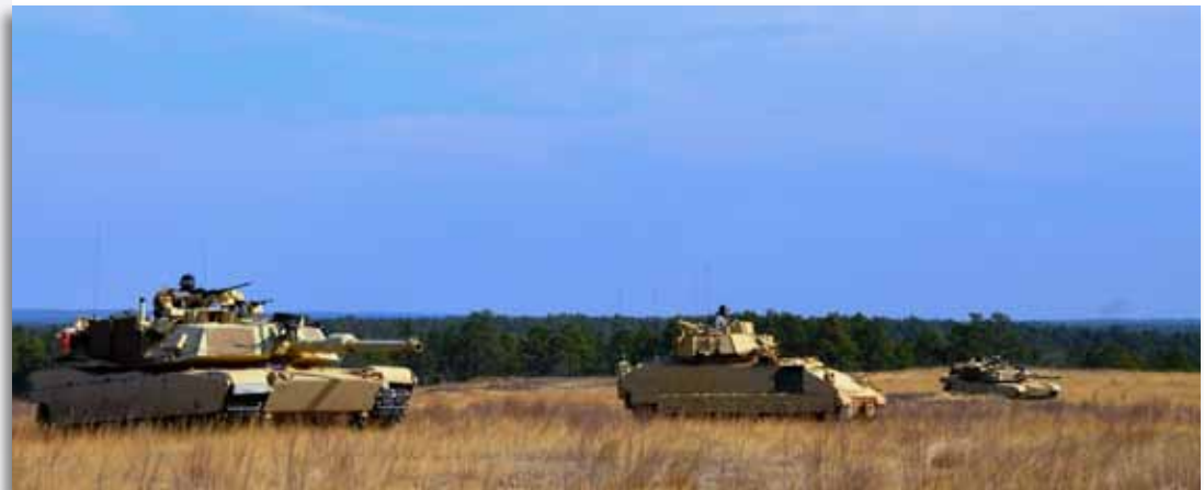
NC NATIONAL GUARD EXECUTES COMBINED ARMS EXERCISE WITH M1A1 ABRAMS TANKS AT FORT BRAGG

North Carolina military installations add specific value and capability to the National defense mission. Our approach to support and enhance North Carolina’s military installations is meant to ensure the viability and continued growth of those missions