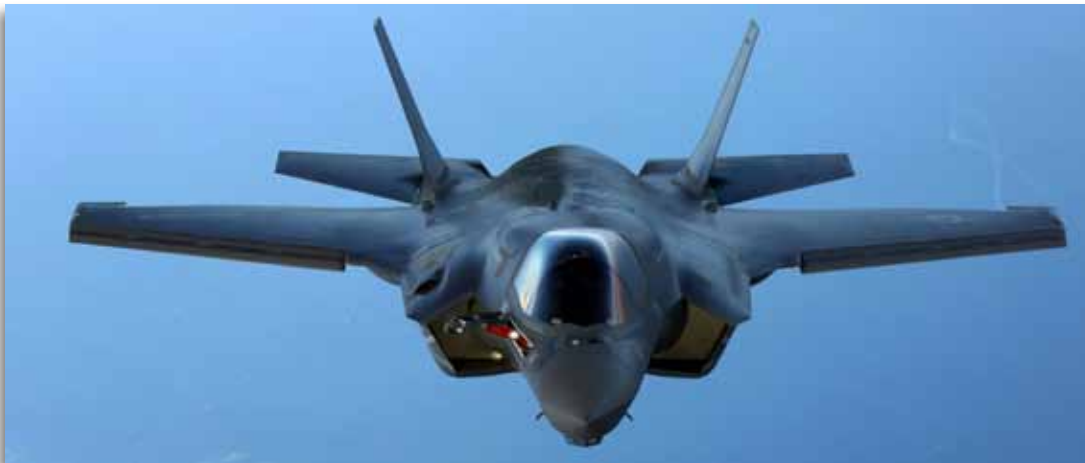
MARINE F-35B JOINT STRIKE FIGHTER FLIES ABOVE MCAS CHERRY POINT