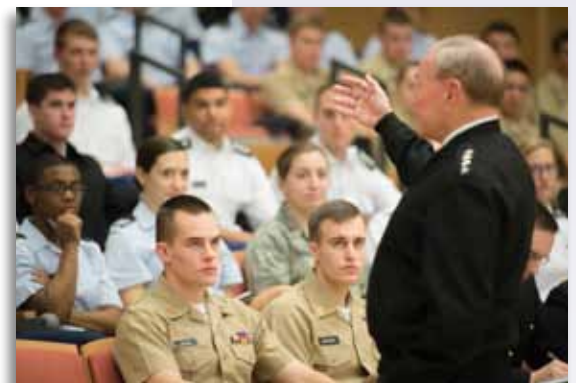
VETERANS CAREER DAY AT CENTRAL PIEDMONT COMMUNITY COLLEGE CHILDCARE AT SEYMOUR JOHNSON AFB JOINT CHIEFS OF STAFF GENERAL (RETIRED) MARTIN E. DEMPSEY SPEAKS TO ROTC CADETS FROM NORTH CAROLINA UNIVERSITIES