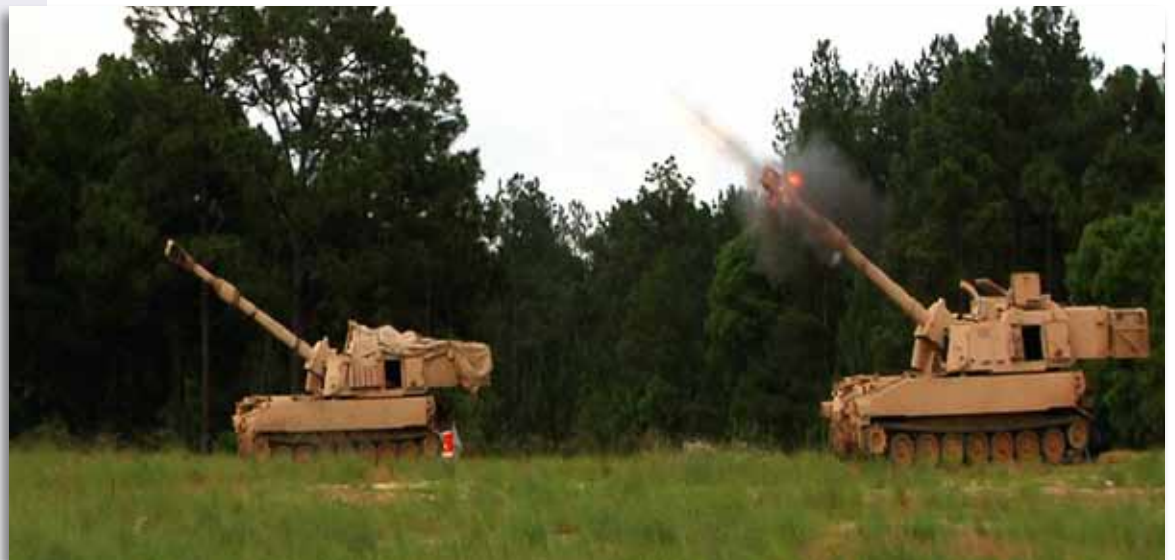
M109A6 PALADINS FIRE DURING NC NATIONAL GUARD ANNUAL TRAINING