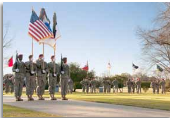
CLOCKWISE FROM TOP LEFT: US AIR FORCE C-130 HERCULES TAXI AT POPE FIELD MARINE STUDIES AT THE MARINE CORPS EDUCATION CENTER ABOARD CAMP LEJEUNE THE XVIII AIRBORNE CORPS COLOR GUARD AT FORT BRAGG

COVER PHOTOS, CLOCKWISE FROM TOP LEFT: 1. US COAST GUARD FLIES C-130J ABOVE COAST OF NC 2. NATIONAL GUARD UNIT FIRES .50 CALIBER MACHINE GUN DURING ANNUAL TRAINING 3. F-15E STRIKE EAGLES FROM SEYMOUR JOHNSON AIR FORCE BASE SOAR ABOVE NC 4. WARRIOR LEADER COURSE COLOR GUARD AT FORT BRAGG 5. MCAS CHERRY POINT AIR TRAFFIC CONTROL TOWER 6. MARINES FROM 22ND MARINE EXPEDITIONARY UNIT BASED AT CAMP LEJEUNE PRACTICE AMPHIBIOUS ASSAULT 7. US SERVICEMEMBERS MARCH IN VETERANS DAY PARADE 8. FLOATING SHIP-TO-SHORE CRANES FROM MILITARY OCEAN TERMINAL SUNNY POINT MOVE UP CAPE FEAR RIVER