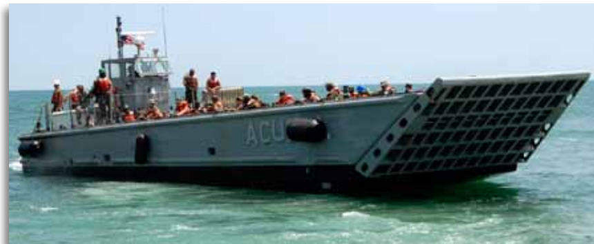
LANDING CRAFT MECHANIZED 14 TRANSPORTS SAILORS, SOLDIERS AND MARINES DURING JOINT LOGISTICS OVER-THE- SHORE EXERCISE