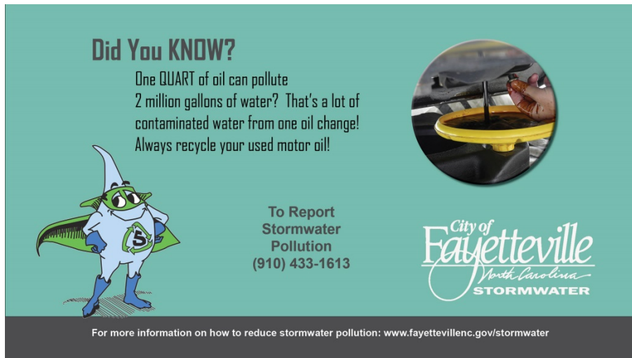
Photograph 2: Fayetteville TV Still Example