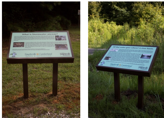
Photographs 4 & 5: Educational Signs on Cape Fear River Trail

The Stormwater Program continues to maintain educational signs along the Cape Fear River Trail. In total, four signs educate citizens about Stormwater, the importance of wetlands, and how the habitats surrounding the Cape Fear River benefit the City. Two of the signs received a facelift this past fall after damage from previous hurricanes had left them with serious damage.