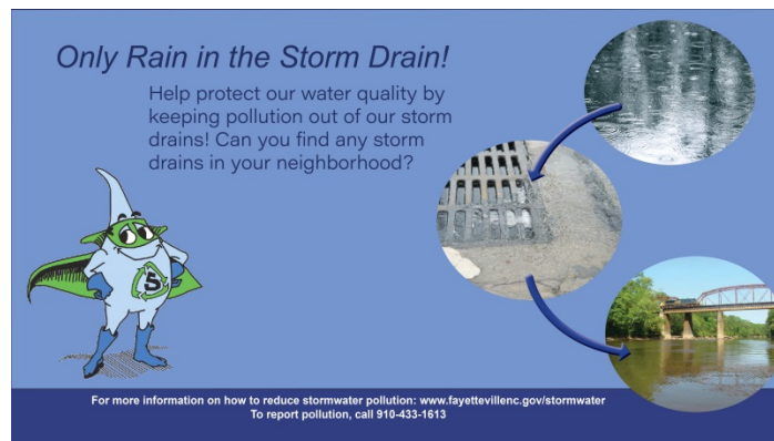
Photograph 3: Social Media Graphic

The Stormwater Educator continued to make formal presentations to local schools, civic clubs, and the general public regarding stormwater pollution. The Educator used various activities and tools such as the Stormwater Floodplain Model, “All About Wetlands,” “Water Quality,” Ask the Bugs!”, “Parachute the Pollution” and “The Incredible Journey” curriculum to aid in public education efforts. When giving school presentations, the Educator ensures that the information provided lines up with curriculum standards, so the presentations are relative to what the students are learning and reinforce what the teacher has taught. The Educator has created a set of lesson plans that are easily emailed to teachers before presentations are given in the classroom.