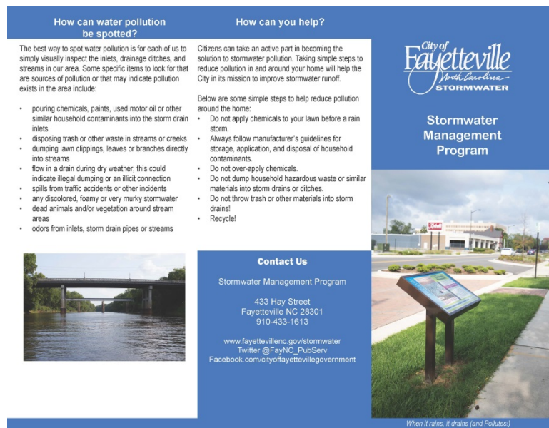
Photograph 1: Stormwater Management Program Brochure